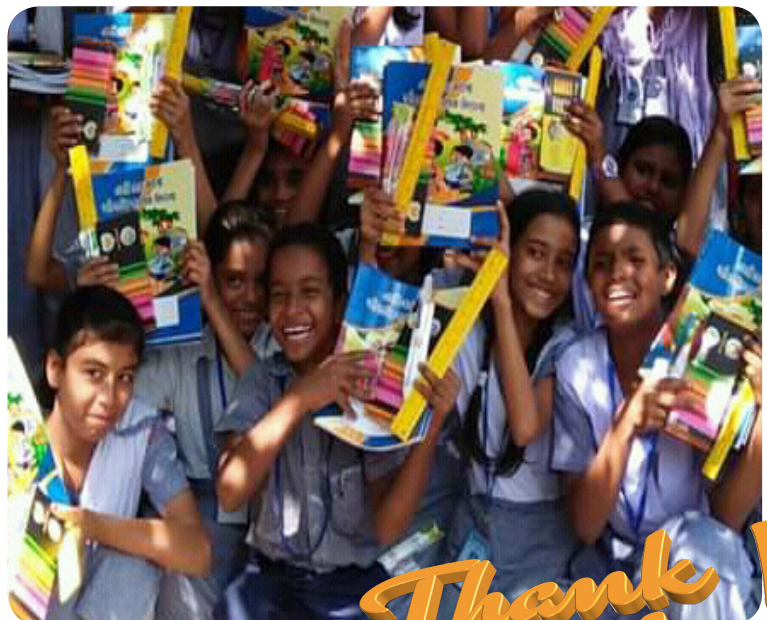
Children excitedly receiving their school materials